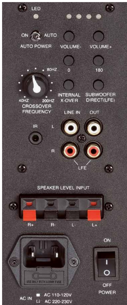
Phase switch, input options, level meter, connection for the remote control eye, wide range for the crossover frequency.

The Velodyne-typical „Digital Drive Control System“ (DDCS) is supposed to ensure extremely low distortion. It should be clear